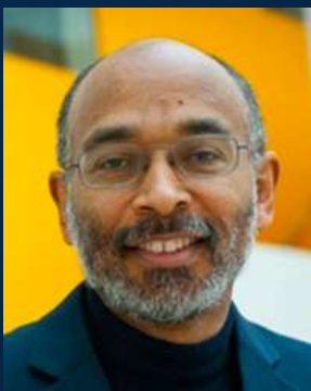
EMERY N BROWN MIT